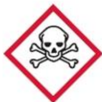
Skull and Cross Bones